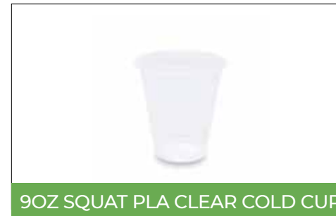
9OZ SQUAT PLA CLEAR COLD CUP