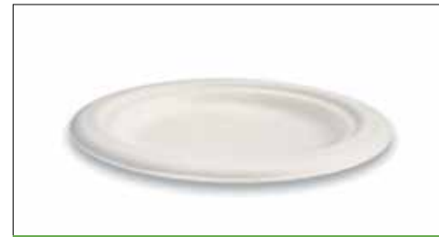
6" BAGASSE PLATE