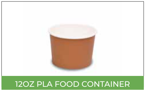
12OZ PLA FOOD CONTAINER