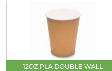
12OZ PLA DOUBLE WALL