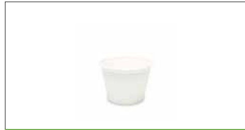
2OZ BAGASSE PORTION CUP