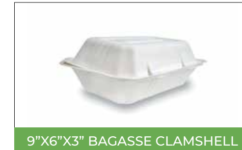
9"x6"x3" BAGASSE CLAMSHELL