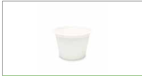
4OZ BAGASSE PORTION CUP