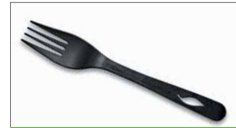
CPLA BLACK FORK