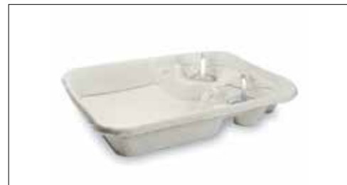
2-CUP CONCESSION TRAY