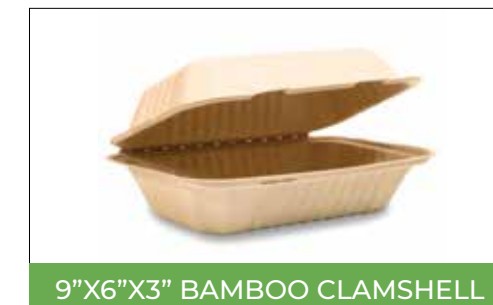
9"x6"x3" BAMBOO CLAMSHELL