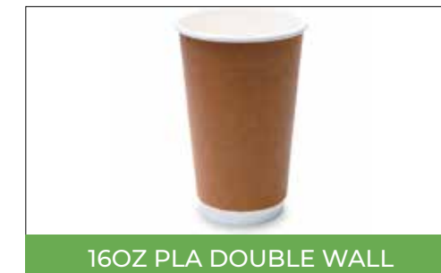
16OZ PLA DOUBLE WALL