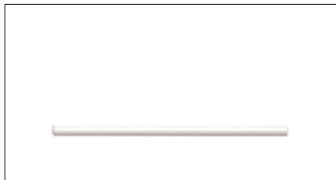
WHITE PAPER STRAW