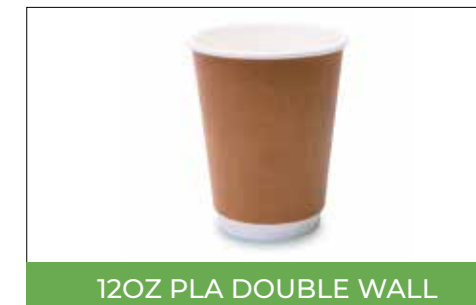
12OZ PLA DOUBLE WALL