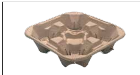
4 CUP DRINK CARRIER