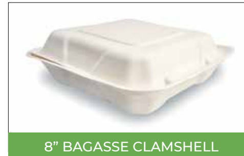
8" BAGASSE CLAMSHELL