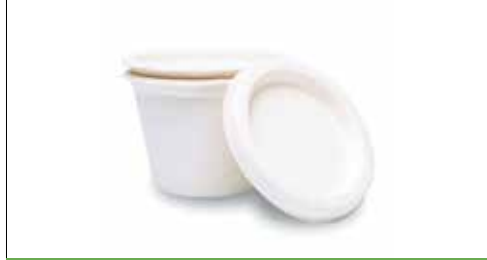
BAGASSE PORTION CUP W/ LID