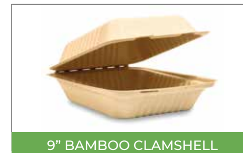
9" BAMBOO CLAMSHELL