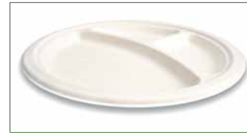
10" BAGASSE 3-C PLATE