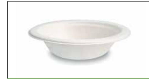
12OZ BAGASSE SOUP BOWL