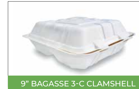
9" BAGASSE 3-C CLAMSHELL