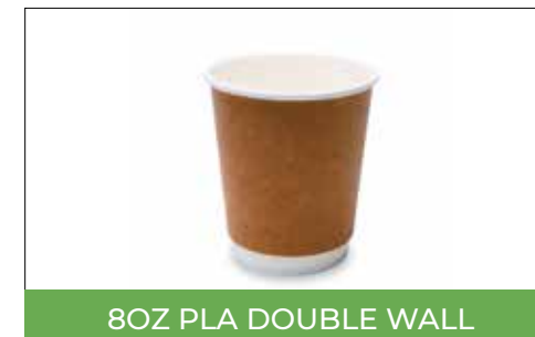
8OZ PLA DOUBLE WALL