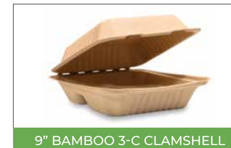
9" BAMBOO 3-C CLAMSHELL