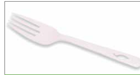
CPLA BEIGE FORK