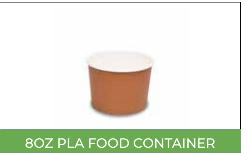
8OZ PLA FOOD CONTAINER