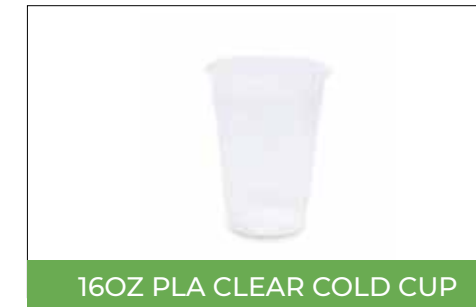
16OZ PLA CLEAR COLD CUP