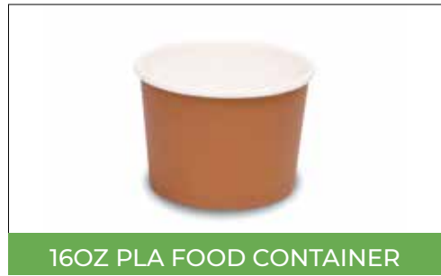
16OZ PLA FOOD CONTAINER