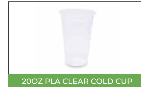
20OZ PLA CLEAR COLD CUP