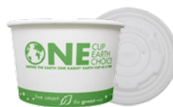
PLA Food Containers & Lids 4 oz