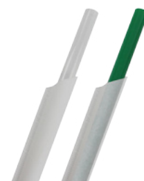
PLA Giant Straw Clear / Green

PLEASE NOTE: Images are for illustration purposes only. Final products may vary.