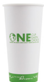
PLA Paper Cold Cups 16/22/32 oz

Lollicup® USA Inc. is committed to expanding its eco-friendly product offerings in order to give you the best options for your business and the environment. The following products are in development. If any of these items catch your interest, feel free to contact a sales representative for more information.